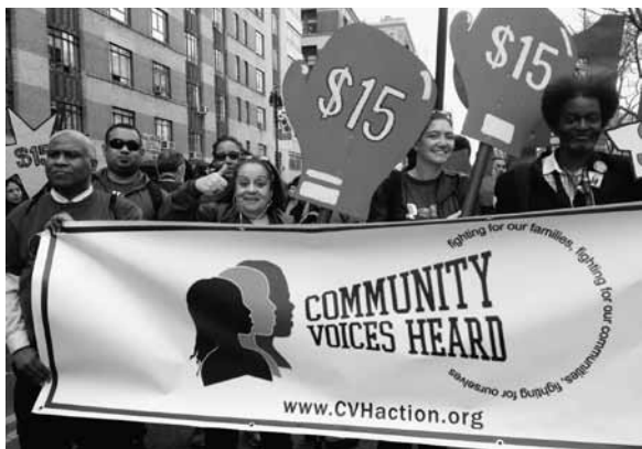
Community Voices Heard

Bailey's Café is a center for educational and cultural activity located in the Bedford-Stuyvesant/Crown Heights sections of Brooklyn. Formed in 2003 with legal assistance from Lawyers Alliance and volunteer attorneys from Stroock & Stroock & Lavan LLP, Bailey's Café focuses on two core areas: community building and service; and arts education and production. Bailey's Café has long-term partnerships with eight schools, more than 20 youth/community-based organizations, and more than 25 teaching artists, and serves 600 youth a year. In 2015, Lawyers Alliance and volunteer attorneys from Kaye Scholer LLP represented Bailey's Café in negotiating and finalizing its first lease. The new space, opened this spring, ensures that the organization no longer has to rely on donated space.