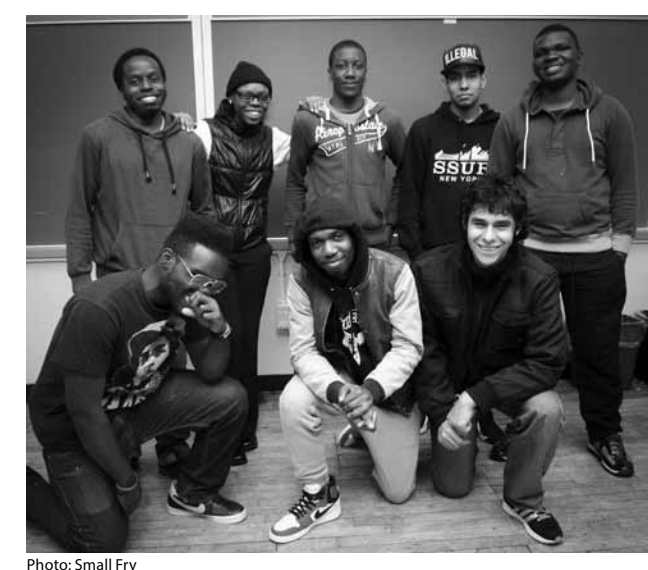
Small Fry trains and employs youth in marketing and web development.

There also has been significant movement relating to workforce development policy in New York City. Mayor de Blasio has created the Office of Workforce Development to establish workforce training policy priorities and to coordinate activities continued on page four