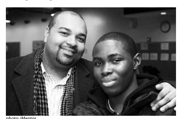
Mentors help youth transition to adulthood

Real Estate Law and Facilities: Quality legal assistance enables nonprofit managers to work through complex real estate issues that can have