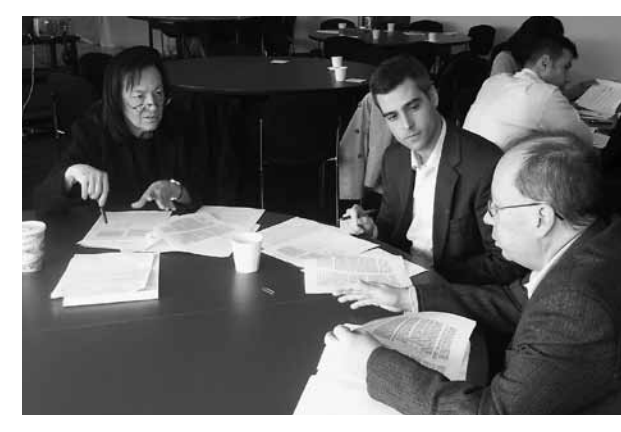
Participants at the Con Edison Legal Clinic