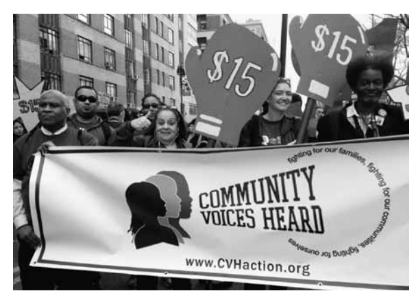
Community Voices Heard

Bailey's Café is a center for educational and cultural activity located in the Bedford-Stuyvesant/Crown Heights sections of Brooklyn. Formed in 2003 with legal assistance from Lawyers Alliance and volunteer attorneys from Stroock & Stroock & Lavan LLP, Bailey's Café focuses on two core areas: community building and service; and arts education and production. Bailey's Café has long-term partnerships with eight schools, more than 20 youth/community-based organizations, and more than 25 teaching artists, and serves 600 youth a year. In 2015, Lawyers Alliance and volunteer attorneys from Kaye Scholer LLP represented Bailey's Café in negotiating and finalizing its first lease. The new space, opened this spring, ensures that the organization no longer has to rely on donated space.